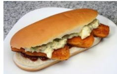
Fried fish sandwich