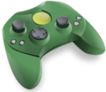
Play video games