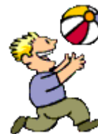
Running and playing