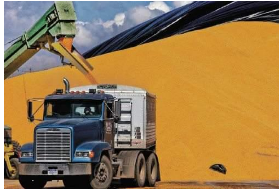
Image 1 :://www.theresasheridan.com/blog/farming-for-links/farmer-inspecting-wheat/

Image 2:http://www.delawareonline.com/article/20110703/BUSINESS/107030323/Ethanol-subsidy-likely-end